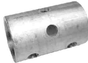
Art. 601 Sleeve. 43mm OD. 4 Holes. BSA Thread Art. 599 Sleeve. As above but Without Holes. BSA Thread Art. 598 Sleeve. Above without Holes. Italian Thread