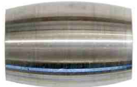
Barrel Sleeve. No Hole. 68mm Width. No Thread. For better distributing bottom bracket stresses.