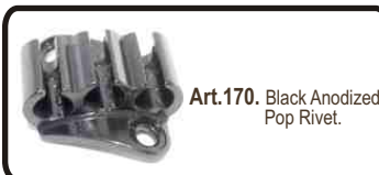
Art. 170. Black Anodized. Pop Rivet.