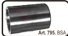
Art. 795. BSA.