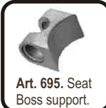
Art. 695. Seat Boss support.