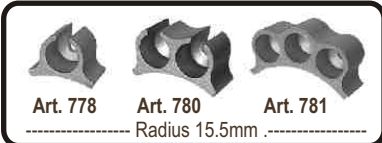
Art. 778 Art. 780 Art. 781 ----- Radius 15.5mm -----