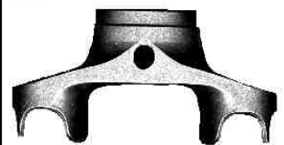
E L C. Lightweight crown. 33mm wheel clearance