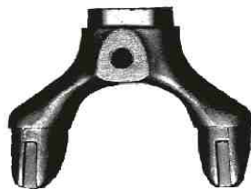
SCA. Requires thicker gauge blades 41mm. wheel clearance. Also available engraved 'REYNOLDS'