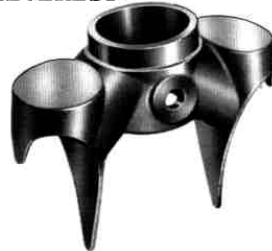
C64. Based on an original American design. 36mm. Wheel clearance.