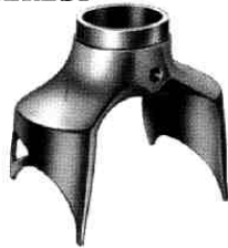
C56K. Stylish crown suitable for Columbus AIR fork blades. 36mm wheel clearance.