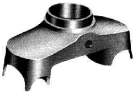
C52. Traditional semi-sloping fork crown. 36mm. wheel clearance.