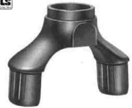
LC04. Narrow shouldered, aero design, with lightweight build. 40mm. Wheel clearance. Weight 160gr. 61.5mm. c to c.