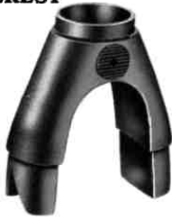
C61A. Narrow crown suitable for Columbus 'D' shape fork blades. 34mm wheel clearance.