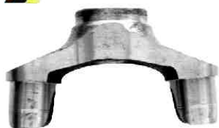
519.75. Forged Fork Crown 38mm Wheel Clearance