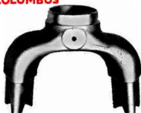
MAX. For Columbus MAXL16V2 MAX Aero fork blades 35.8x18.5mm 41mm. Wheel clearance