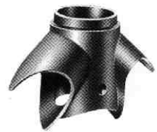
US. Uni Crown for 25.4mm. round blades. C199. Uni Crown for 28.6mm. round fork blades, and 28.6mm. steering column.

Crowns are for 25.4 steerer and 28x19mm oval Blades except where indicated.