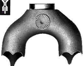
3021. For Oversize fork blades 30 x 21mm Oval. 33mm. Wheel clearance