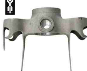
P1 Fork Crown. 43mm Wheel Clearance