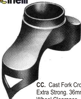
CC. Cast Fork Crown Extra Strong. 36mm Wheel Clearance.